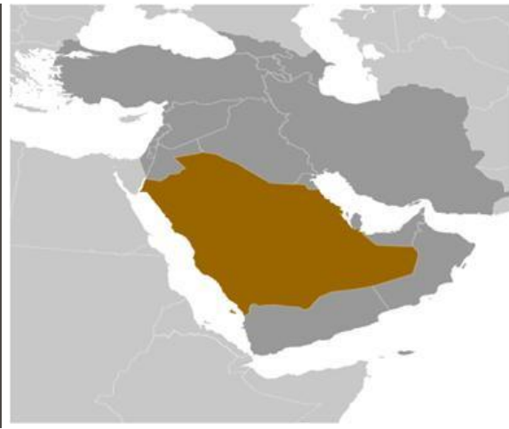
Figure 2. Saudi Arabia Location