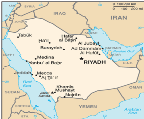
Figure 1. Map of Saudi Arabia

Yemen on the South, and the United Arab Emirates, Qatar, and the Arabian Gulf coast line of 560 kilometers on the East (Ministry of Education, 2017). See Figure 1 and 2.