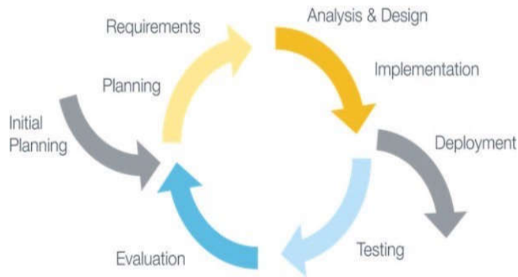
Figure1. The responsive design process, (Heppard, 2012)

The classical application design process is linear. When a step ends, the next step begins. The progression of the steps is only in one direction but when problems occur, solutions are not performed gracefully. One of the problems of the classical application design is creating only for the standard desktop browsers. Once the responsive design implemented, the application can be used properly on desktop computers, mobile devices, and tablets (Heppard 2012). The responsive design process is shown in Figure 1.